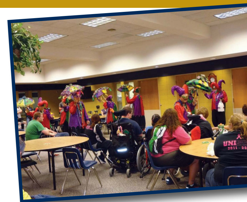
Revelers performing at OU