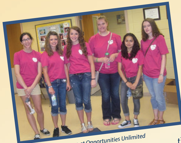
Briar Cliff Nursing Camp at Opportunities Unlimited

follow up on doctor's orders, ensure that laboratory tests are performed in a timely manner, and prepare all our many emergency kits. Nurses alternate "on call" responsibilities and are prepared to handle any medical emergencies that might arise. Not only do they care for the physical and emotional needs of our persons served, but on occasion that of staff as well. Nurses are often called upon to assist residential staff with care of our persons served and willingly work as members of the team alongside those of our residential partners. We are all proud to be part of the OU family. If you would like to know what it is like to make a difference in people's lives every day we encourage you to join the OU Nursing Team.